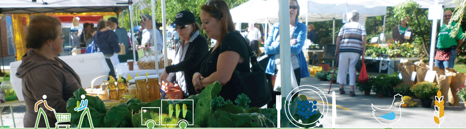
Farmers' market patrons buying produce in Kane County, Illinois.